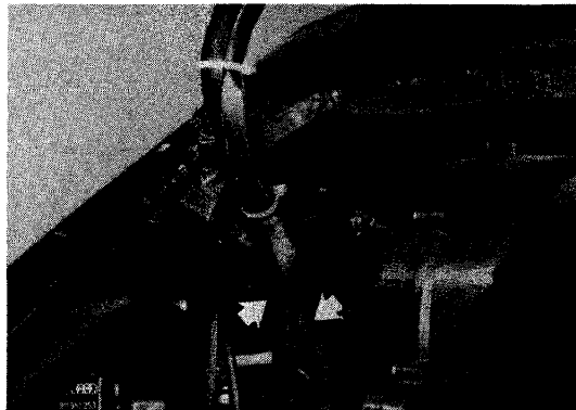
Former Routing Figure 1

From VIN: 96 _ MS 41 1509 - Coupe 96 _ MS 44 0726 - Targa 96 _ MS 46 2089 - Cabriolet